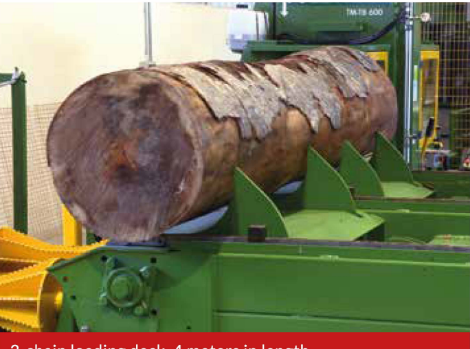
3-chain loading deck, 4 meters in length