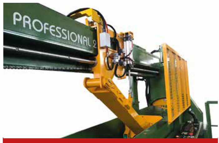
Lifting pusher with mechanical/pneumatic system

Equipment elevation: facilitates the maintenance and cleaning operations