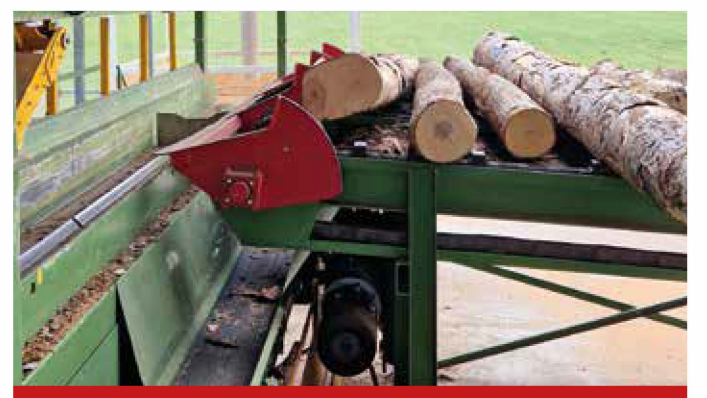
Half-moon loading system