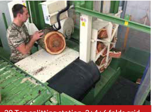
20 Ton splitting station, 2+4+6 folds grid