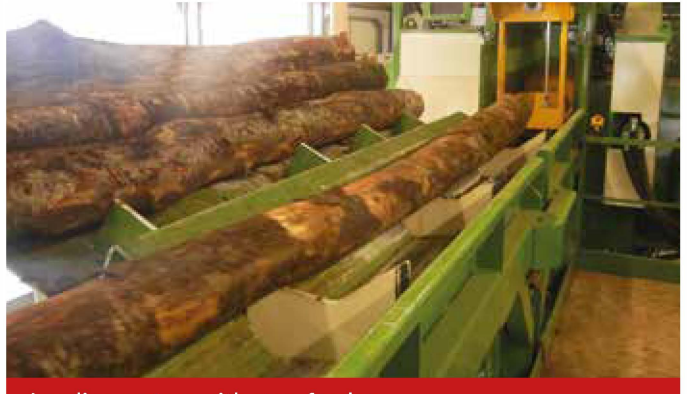
Loading system with step-feeder