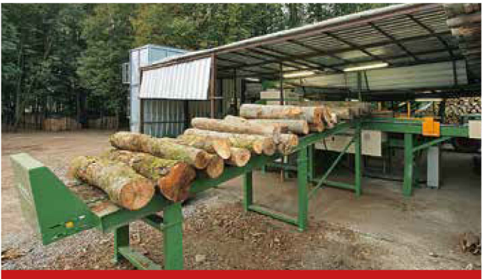
Logs loader with closing infills