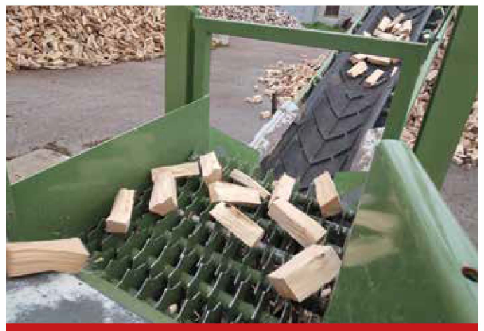
Cleaning rollers for bark and residual sawdust

hydraulic orienting for conveyor with wheels