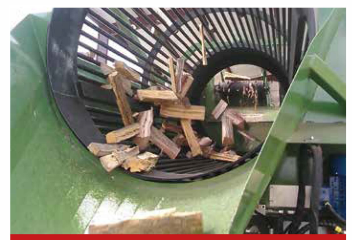
Drum screener for bark and residual sawdust