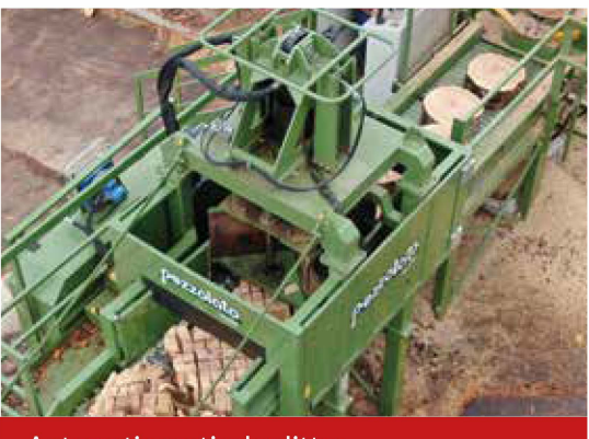
Automatic vertical splitter