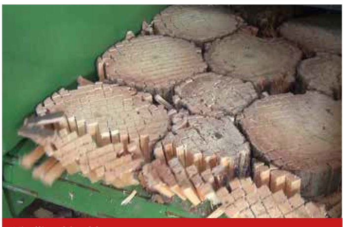
Kindling 20 x 20 mm