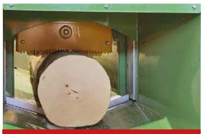
Feeding with logs