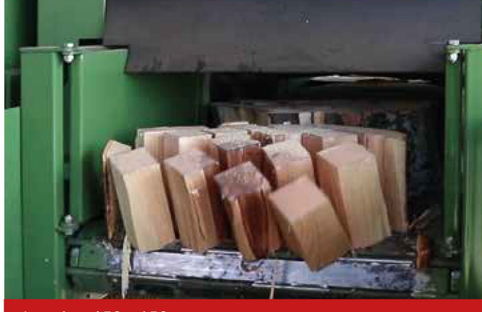
Log size: 150 x 150 mm