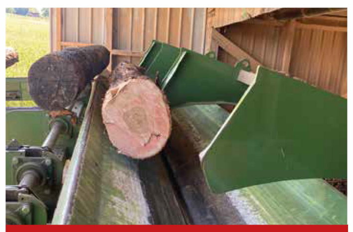
Log loader and damper arm