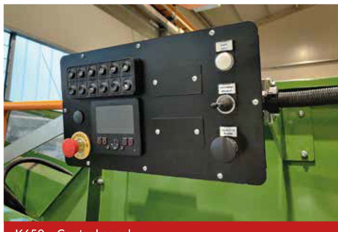
K650 - Control panel