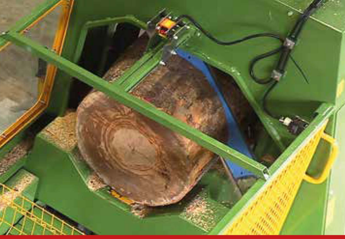
Photocell for automatic log length measurement