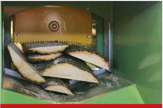
Feeding with sawmill edgings

From the control panel the operator controls the log loader, sets the cutting length, and can set the machine to work in manual or automatic mode.