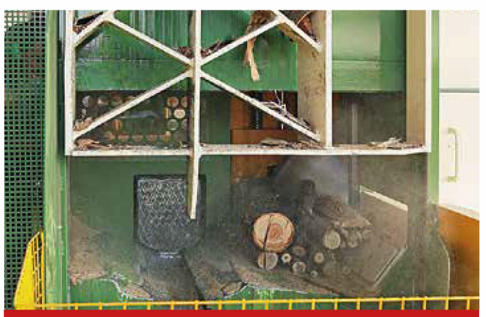
TLC - Cutting configuration