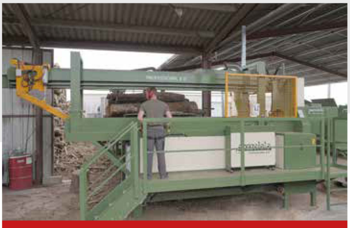
Platform for control board with stairs