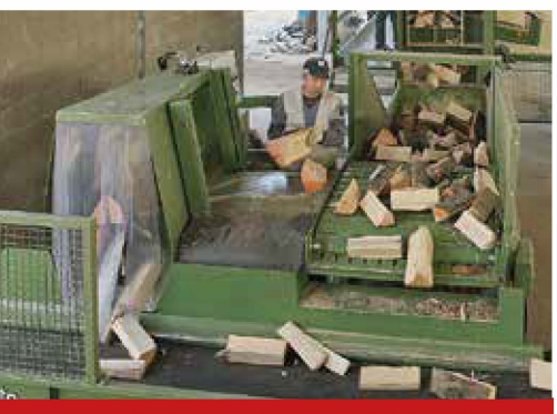
11 Ton splitting station, 2+4 folds grid