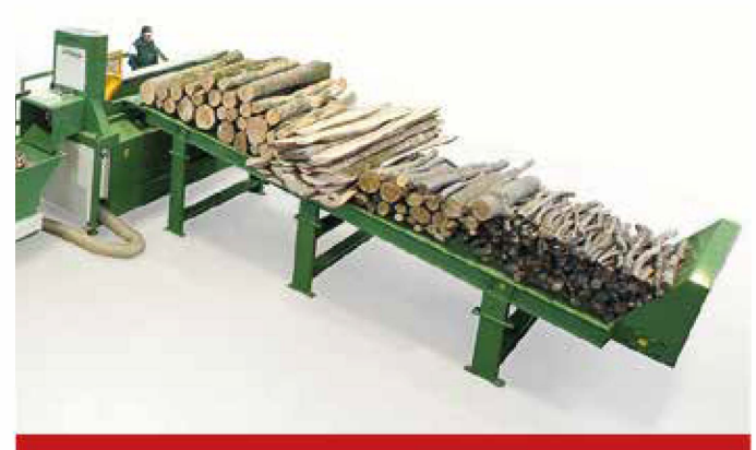
Logs loader with closing infills

"S" belt - Defined belt with "S" structure for transporting and accumulating wood, once it has been cut, produced with a robust electro-welded structure, equipped with a concealed and protected chain made of high-strength metal mesh, one metre wide.