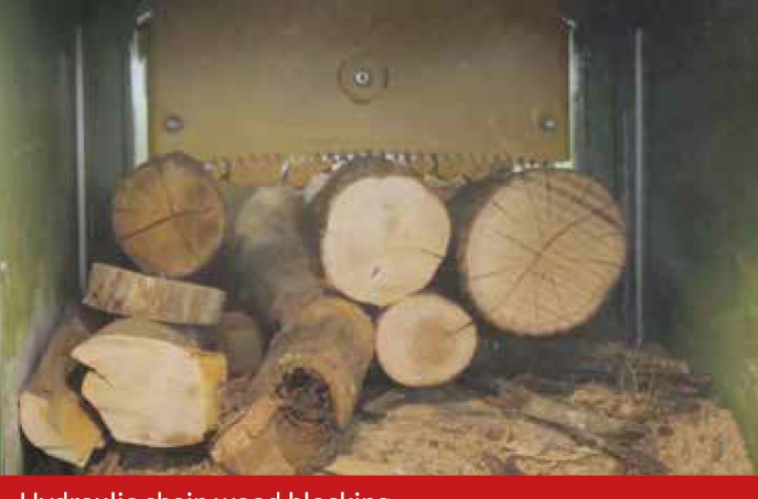
Hydraulic chain wood blocking