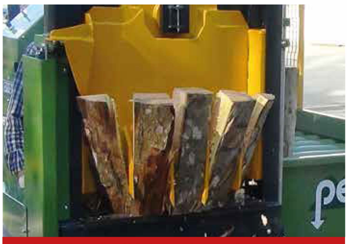
Wedge with 4 orbital blades producing 5 logs per cycle