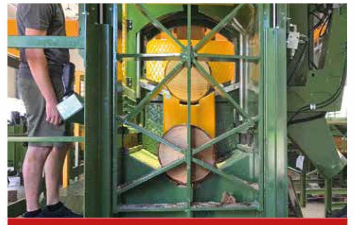
TLF - Cutting and splitting configuration

With the simple exclusion of the splitting grid, these machines can also process smaller log bundles that do not need to be split.