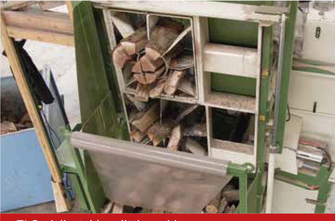
TLC - Adjustable splitting grid

The special geometry of the machine allows the operator to have a view and control of all work phases, without any additional effort.