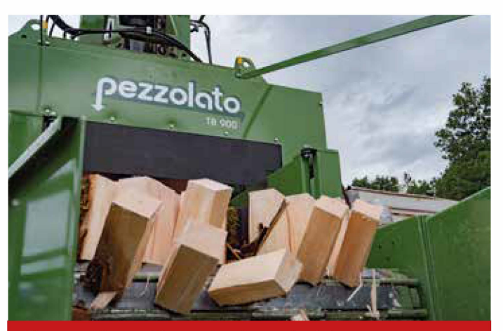
Firewood logs with regular size and minimum wastes