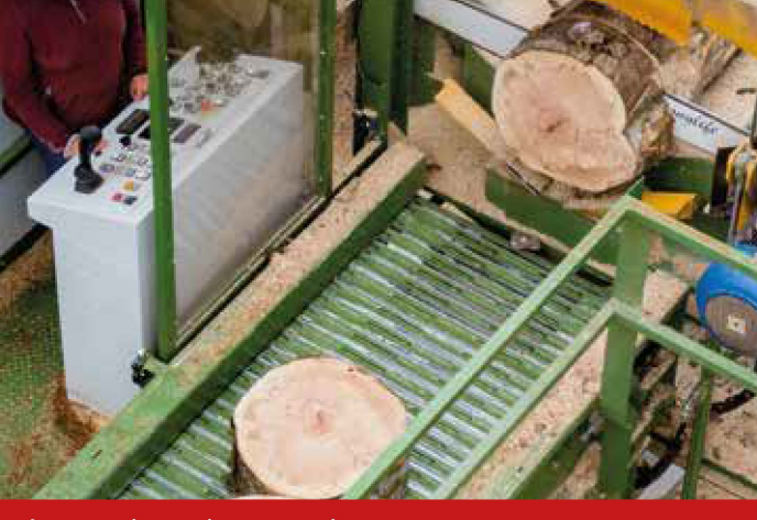
Automatic cutting operation