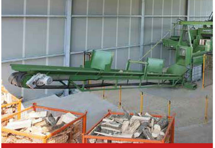
hydraulic orienting for fastened conveyor

Hydraulically driven cleaning rollers for separating bark flakes and sawdust from logs. When combined with a PLC-controlled machine, electronic control with "no stress" system is available.