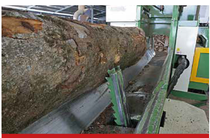
Hydraulic log turner