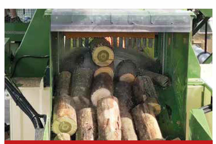
Mechanical jacks locking system.