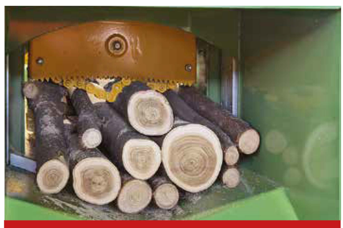
Chain locking system. Efficient on all species of bundles